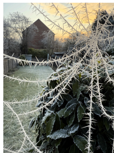
Tom Cuthbert: Cold