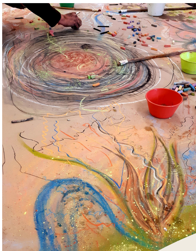
Drawing workshop in progress

"Confirms why I love Shropshire so much!" "Very beautiful work; every image speaks of Shropshire" "Came to the Shropshire photographic exhibition. Lovely, really enjoyed it"