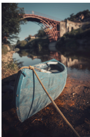
Jason Albutt: Blue Canoe, Old Ironbridge